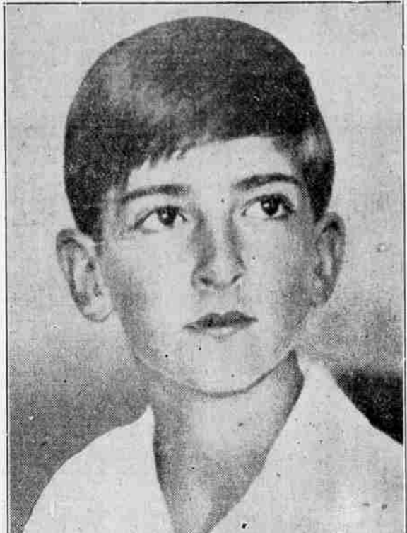
Assassins' bullets which killed his father, King Alexander, and Louis Barthou, French foreign minister, as they rode in an automobile in Marseille, made this 11-year-old boy, Peter, the new king of Yugoslavia. The youth, who was named king under a regency a few hours after his father's death, has been attending an exclusive English boys school at Cobham, Surrey.