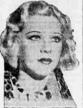
Glenda Farrell is one of the hard-bolled "Merry Wives of Reno," now playing at the Studio theater. This comedy concerns the hilarious adventures of fast-stepping wives in a fast-stepping town.

The cast includes Margaret Lindsay, Glenda Farrell, Guy Kibbie and Hugh Herbert.