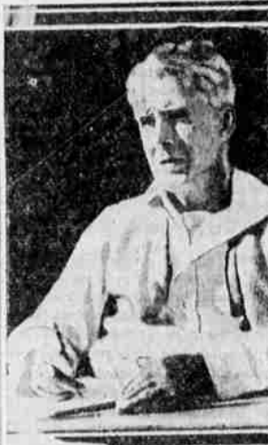
Zane Grey, "best seller" writer and world's champion fisherman is starred in the thrilling deep sea film, "South Sea Adventure," which heads the RKO theater program tomorrow.

Some most unusual inventions of modern science were used in the filming of "The Vanishing Shadow," which starts tomorrow.