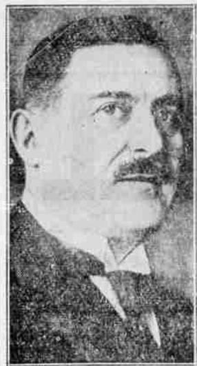
General Para Zivkovich (above), political "strong man" of Yugoslavia, was expected to be influential in shaping the nation's policies after the assassination of King Alexander.