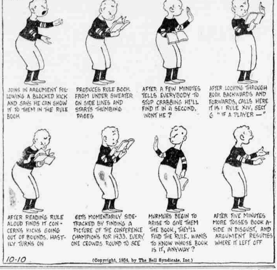
10-10 (Copyright, 1934, by The Bell Syndicate, Inc.)