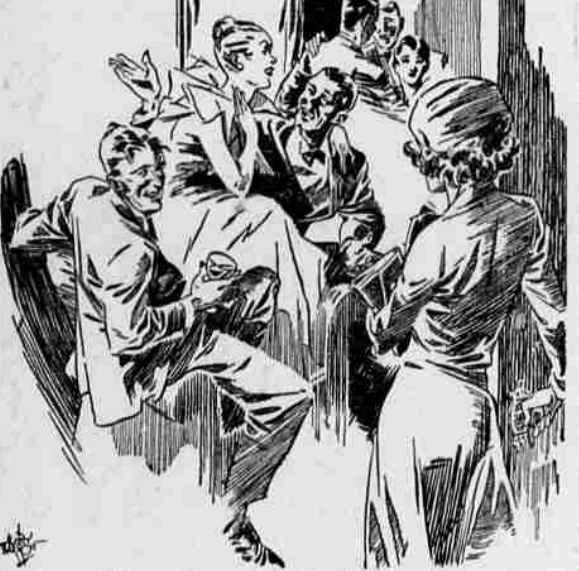
10-6 (Copyright, 1934, by The Bell Syndicate, Inc.)

Immediately man down the street starts blowing horn for his wife; neighborhood dogs in full cry pursue a cat and 15 tons of coal are delivered next door.