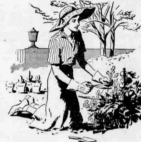
She's not surprised if sweet peas appear in the tomato patch