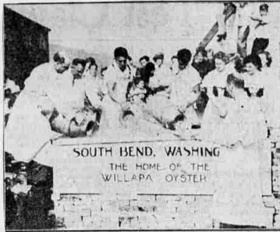
SOUTH BEND, WASH. THE HOME OF THE WILLAPA OYSTER

Proclaimed by residents of South Bend, Wash., as the world's largest oyster stew, 100 gallons of the bivalves, 300 gallons of milk and 60 pounds of butter were poured into a big pan and cooked for 5000 hungry visitors. Japanese oysters have been successfully transplanted to the area and the industry has assumed major proportions. Some of the cooks are shown filling the outdoor pan.