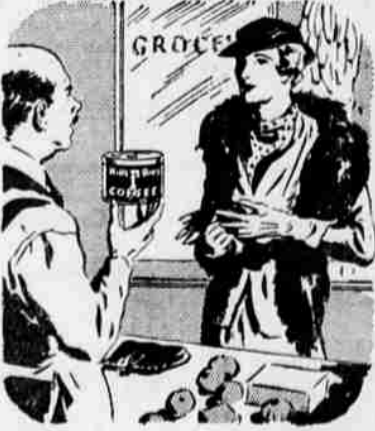
The Shaws have always ordered Hills Bros. without ever changing

But she's through with adventure when it comes to coffee. She knows her own mind there! And she knows that Hills Bros. Coffee gives her and her husband uniform flavor delight. Hills Bros.' exclusive Controlled Roasting Process assures uniform perfection of flavor, day after day. Year after year. And that's why the Shaws have always ordered Hills Bros. Coffee without ever changing—even if the Shaw garden changes every year!