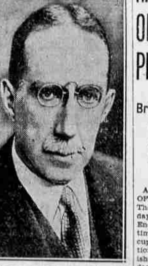
After peace had been restored in Rhode Island's textile strike area, Gov. Theodore Francis Green (above), said there would be no occasion for calling on the federal government for troops. He blamed a "communist uprising" for the state's violence.