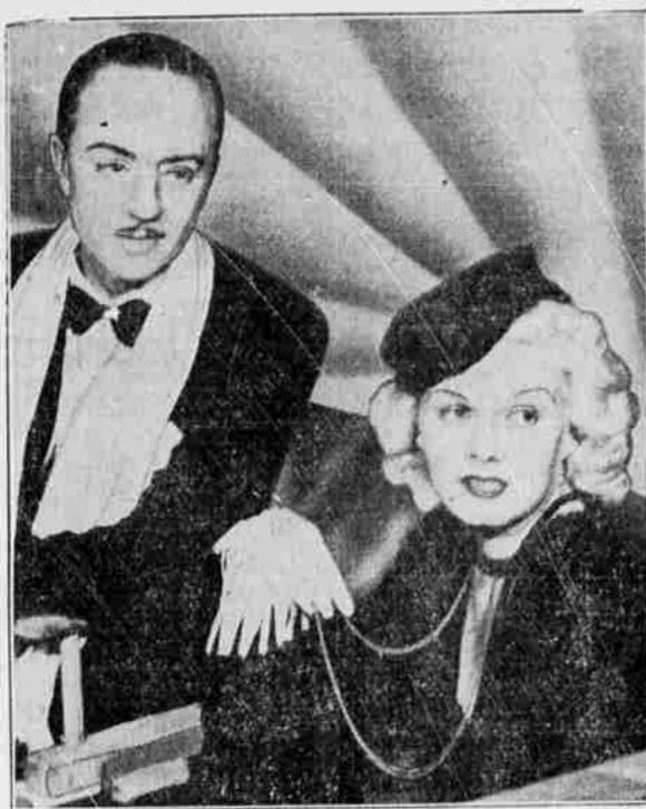
Jean Harlow and William Powell of the films have been seen together so frequently in Hollywood that speculation has arisen regarding prospects of a romance. They are shown as they appeared at the presentation of "A Midsummer Night's Dream" at the Hollywood bowl.