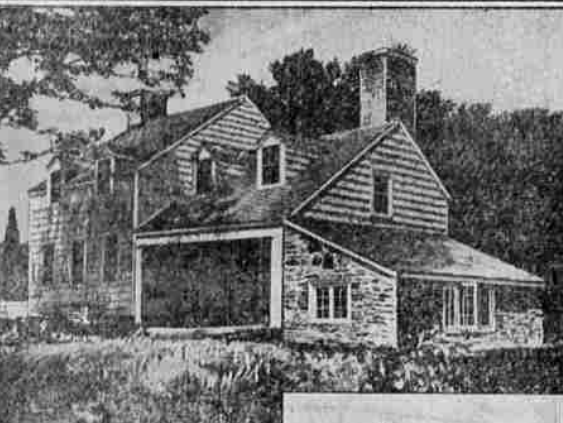
The improvement made on a farm house by modernizing is graphically shown in these illustrations. Above is the home as it appeared after the work was completed, while below is the place as it appeared at the outset.