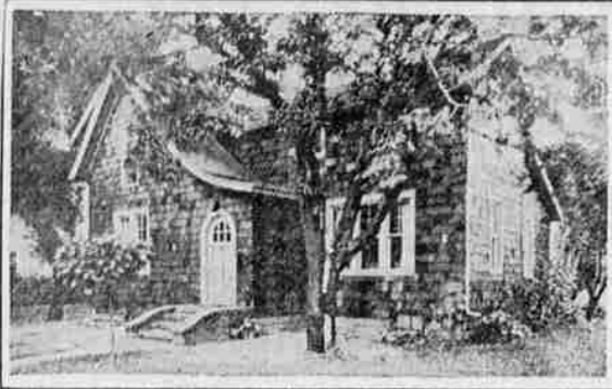
These illustrations show how a home, run-down in appearance, can be completely transformed into an attractive, livable dwelling with a little modernization operation.