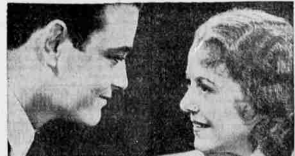
In the Will Rogers film, "State Fair" now playing at the Roxy theater, Janet Gaynor is at her best as a little farm girl who learns about love from a dashing young newspaper man played by Lew Ayres. The comedy hit relates the adventures of middle western family at a state fair.