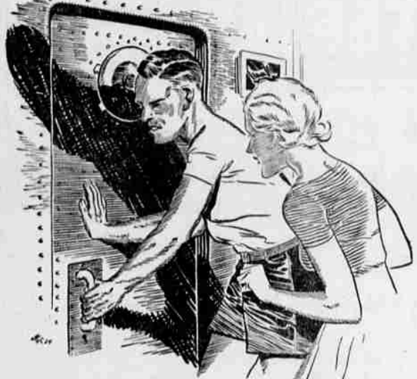
They were trapped like rats.

9-18