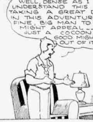
By George McManus