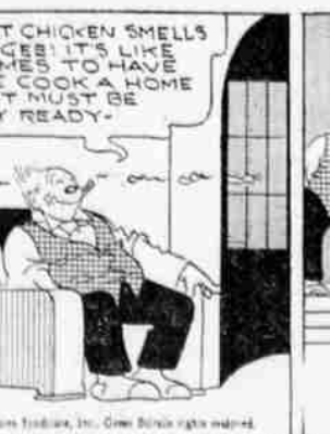
© 1934 King Features Syndicate, Inc. All Rights Reserved.