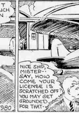
By EDWIN ALGER