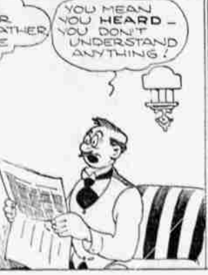
I UNDERSTAND YOU WERE THE INSTIGATOR OF THIS TAR AND FEATHER PARTY WHICH CAME OFF THE OTHER NIGHT