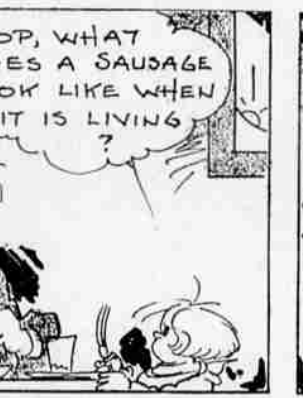
By Hal Forrest