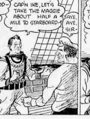
By Sol Hess