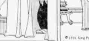
WELL, LISTEN, BUTCHER! ARE YOU SURE THOSE CHICKENS YOU SENT ARE FRESH AND TENDER? YOU KNOW I'LL HAVE NOTHING BUT THE BEST.