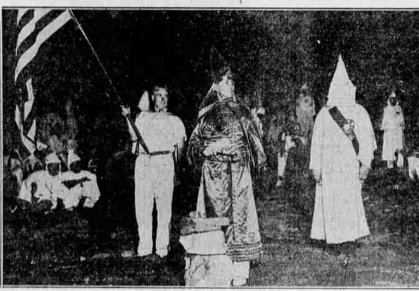
For the first time in ten years, members of the Ku Klux Klan gathered on Stone mountain, birthplace of the order near Atlanta, Ga., and initiated new members. The picture shows high officials, names not disclosed, conducting ceremonies at which 28 klaverns were said to be represented.