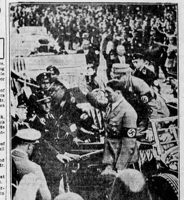
Chancellor Adolf Hitler of Germany (center, saluting) is shown as he arrived at the Kroll opera house in Berlin to address the Reichstag regarding the "purge" of the Nazi regime. In this speech he disclosed that 77 lost their lives in his move to wipe out plots of his enemies.