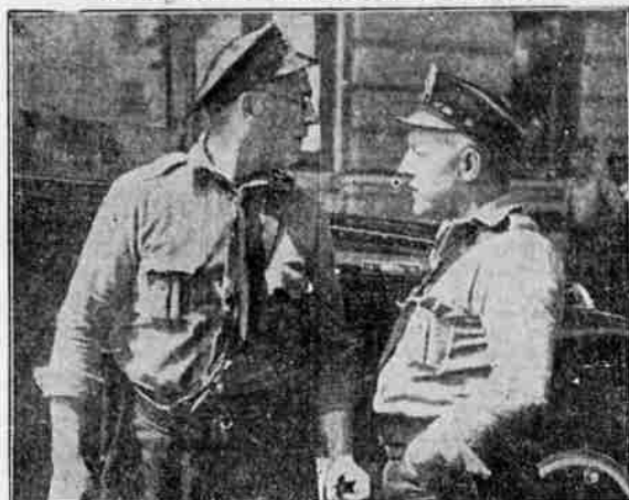
FIGURE IN $427,000 HOLDUP

NEW YORK, Aug. 25.—(AP)—Convinced that the "break" in the $427,000 Brooklyn armored car holdup will come from a disgruntled member of the gang, the U. S. Trucking corporation tonight posted rewards of $32,000 for recovery of the loot and apprehension of the thieves.