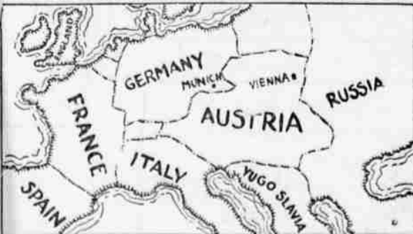
Civil war flared in Austria following the assassination of Chancellor Dollfuss. European powers began negotiations to insure Austria's freedom from a union with Germany. Premier Mussolini of Italy ordered troops ready for action and Premier Doumergue of France as well as London urged "sensible action" and Germany denied it had played any part in the upheaval. (From Associated Press)