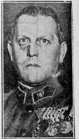
Emil Fey (above), former Austrian vice-chancellor who was imprisoned by the Nazi putschists who killed Engelbert Dollfuss, described his experience in the crisis following his release. He said the Nazis had threatened him with death.