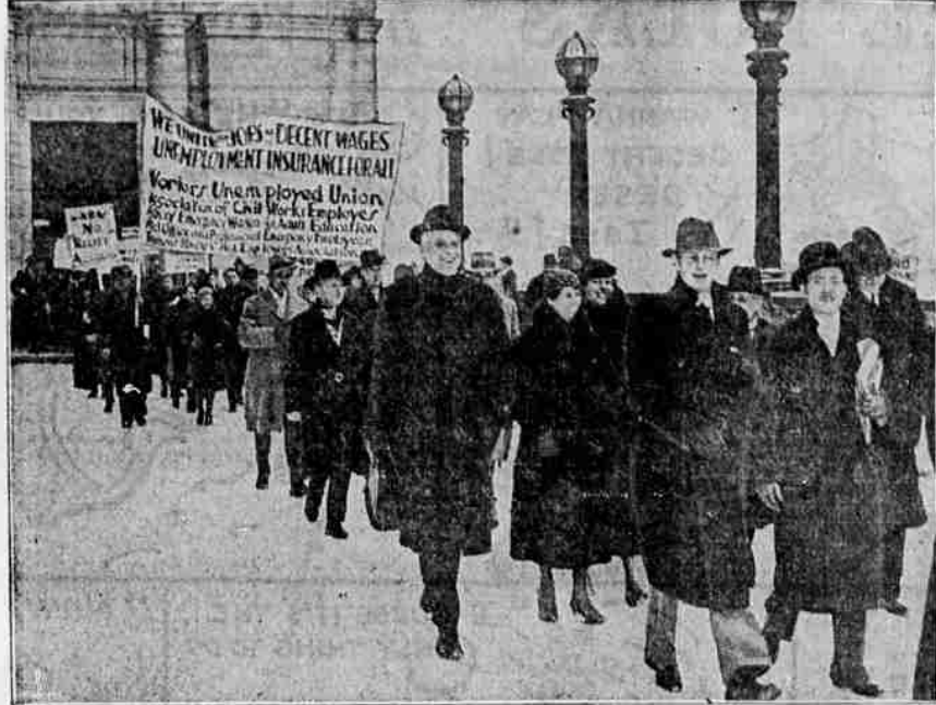
Led by Norman Thomas, socialist candidate for President in 1932 (carrying briefcase), unemployed persons from several eastern cities staged a march of protest in Washington against discontinuance of civil works projects.