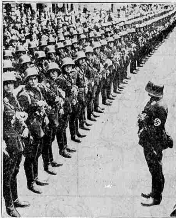
Shown here is a typical group of Austrian Nazi troops, some of whom invaded the federal chancellery in Vienna and assassinated Chancellor Dollfuss, allowing him to bleed to death without benefit of medical aid or clergy after firing several shots into his body.