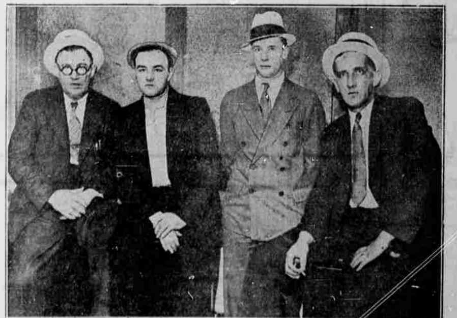
This quartet of East Chicago, Ind., police officers had the satisfaction of avenging the slaying of one of their fellow policemen at the hands of John Dillinger during a bank holdup, when they cooperated with federal agents in the surrounding and killing of the desperado in front of a Chicago movie theater.