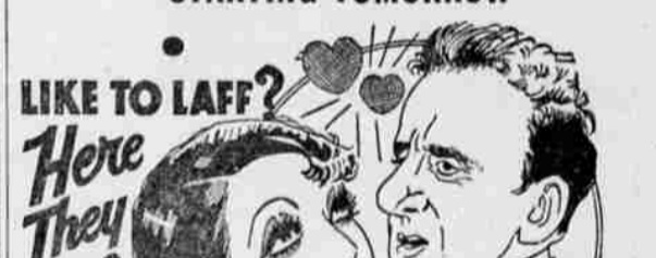
LIKE TO LAFF? Here They are!