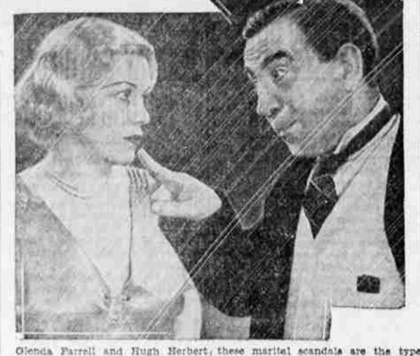
Glenda Farrell and Hugh Herbert are one of the numerous pairs of husbands and wives having their troubles in "Merry Wives of Reno."

playing today and tomorrow at the Craterian theater. The other husbands and wives are Margaret Lindsay, Ruth Donnelly, Donald Woods and Guy Kibbee.