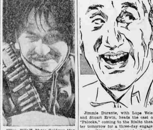
Jimmie Durante, with Lupe Velez and Stuart Erwin, heads the cast of "Palooka," coming to the Rialto theater tomorrow for a three-day engagement. Others in featured roles include Marjorie Rambeau, Robert Armstrong, Mary Carlisle, William Cagney, Jimmie's big brother—Thelma Todd and Gus Arnheim with his orchestra.

A hilarious film concoction, "Palooka" tells the story of a lovable but not-quite-bright lad, played by Erwin, whose mother tries to prevent him from going the way of his bright-light loving dad.