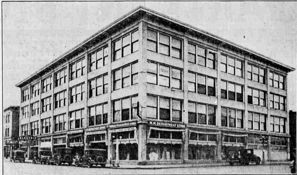
The Medford building, corner of Sixth street and Central avenue, houses the M. M. Department Store. This is one of Southern Oregon's largest and finest business structures.