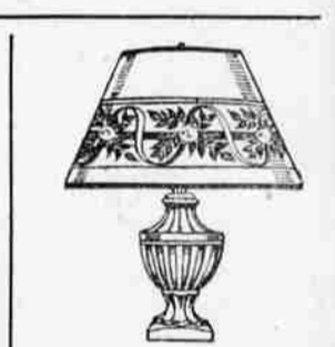
Table Lamp Complete with Shade! Sale-Priced! Composition base; parchmentized shade to match. $1.88

Scatter Rugs Price Goes Up After the Sale! Sturdy Axminster, bright colors. 27 x 50 in. size. $2.19