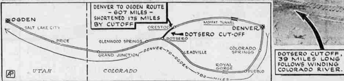
The Dotsero cutoff, shortening the rail route between Denver and the Pacific Coast by 175 miles and putting the Colorado capital on a through transcontinental line for the first time, at last is ready for traffic. The two views above show how the cutoff, 39 miles long, follows the winding Colorado river through the mountain country of western Colorado. The map illustrates the saving in mileage possible through use of the cutoff in conjunction with the famous Moffat tunnel through James peak.