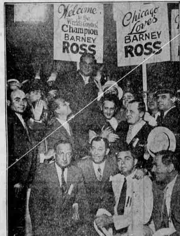
When Barney Ross came back home to Chicago with the world welterweight title in his belt, he was congratulated by civic leaders and paraded through the downtown district. He is shown on the shoulders of boyhood friends and other admirers, who cheered his recent victory over Jimmy McLarnin, giving him the welter title along with the lightweight and junior welterweight championships.