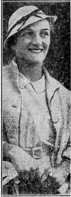
Helen Jacobs, the American tennis champion, is shown as she arrived in New York from England where she was defeated in the Wimbledon finals by Dorothy Round.