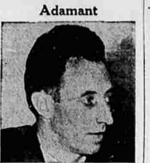
Adamant Harry R. Bridges, chairman of the International Longshoremen's Association strike committee in San Francisco, told President Roosevelt's longshoremen's board that he would not return to work until the union wanted to run hiring halls and asserted demands of other maritime unions must be met before his men return to work.