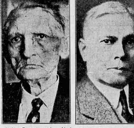
Andrew Furuseth, aged president of the International Seamen's union, was taken to a San Francisco hospital suffering from a heart ailment and other complications aggravated by his untiring efforts to lead negotiators in settling the Pacific coast maritime strike which tied up hundreds of ships.