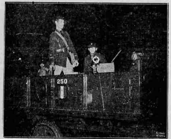
A machine gun squad arrives at the waterfront for patrol duty.