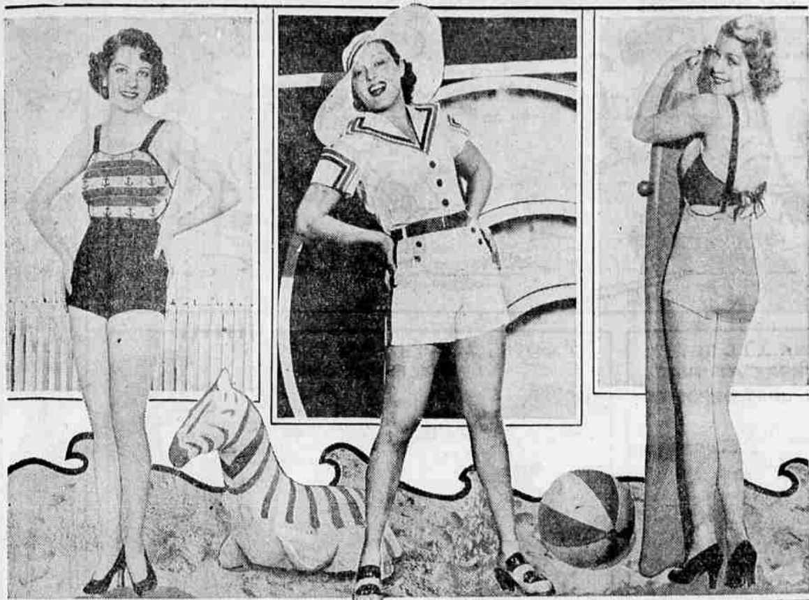
Swimming, beach games and basking in the sun are next on the calendar, and these film players are wearing stylists' newest offerings for such pleasures. Blanca Vischer (left) favors a one-piece swimming suit with trunks of navy blue and the upper part of the suit in light blue, red and white. A beach swagger costume of heavy pique is worn by Suzanne Kaaren (center). White and blue stripes outline the collar and cuffs. There is a red, white and blue band around her large white pique hat. Claire Trevor (right) is wearing a practical swimming suit of bright yellow wool. The side straps and shoulder straps, which tie in back, are of green rubberized silk.