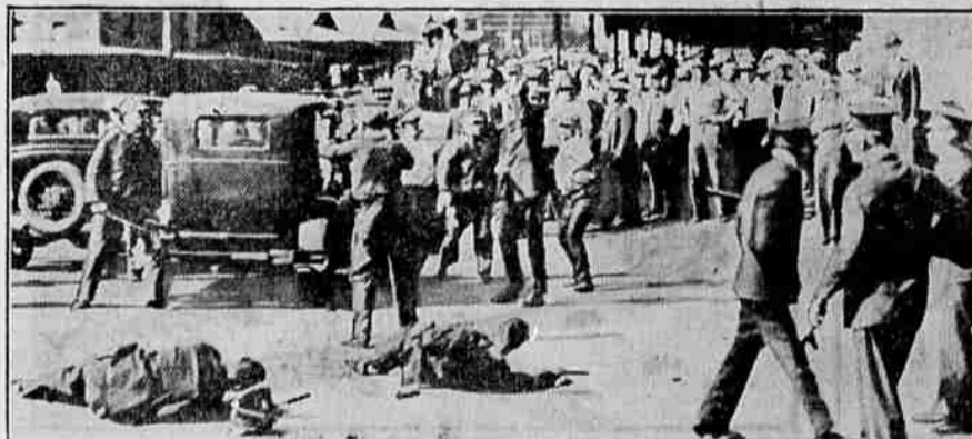
These pictures provide striking views of the action in Minneapolis riots during a strike of truck drivers. The exciting scene at top shows policemen and strikers slashing away at each other with clubs, pipes and other weapons, and below a policeman and a striker are shown lying prone on the street after being knocked out.