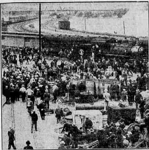
Mounted officers and patrolmen on foot are shown in Seattle, Wash., clearing strike pickets off a railroad track leading to the piers. Three of the striking longshoremen received head injuries as police swung night sticks. The piles of junk in the foreground were gathered by the strikers to block the track.