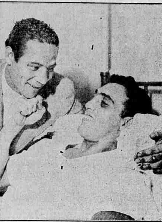
"This is how it will be when we fight again," Primo Carnera, de-throned heavyweight champion, tells Max Baer, his conqueror, in a New York hospital where the huge Italian is recovering from a fractured ankle...