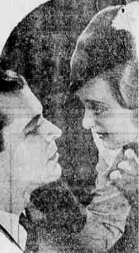
Lyle Talbot and Bette Davis have leading roles in "Fog Over Frisco" on the Rialto theatre's feature program for Friday and Saturday, "The Hell Cat," with Ann Sothern and Robert Armstrong.