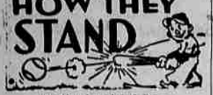
HOW THEY STAND

Portland Beavers, why don't you look at these boys just once?