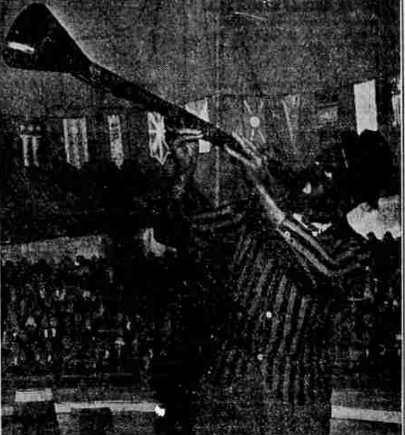
The Gilmore Circus, which is now on a good will tour, will play a one day's engagement at the Craterian theatre today. On the screen, Joan Blondell and James Cagney will be co-starred in their first picture together since the memorable "The Crowd Roars." In "He Was Her Man," the theme is woven around a thoroughly unscrupulous underworld character who has a way with women and takes his love where he finds it.