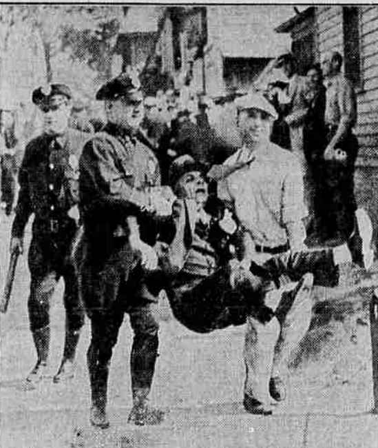
Scenes of disorder and violence were common as strikers laid siege to the Electric Auto-Lite company in Toledo. Police are shown dragging a demonstrator from the rioting which continued for many hours until national guardsmen arrived.