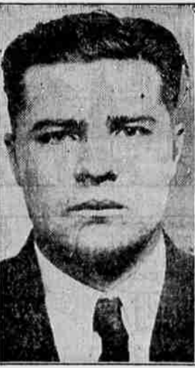
Charles "Pretty Boy" Floyd, widely hunted southwestern gunman