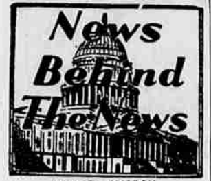
News Behind The News