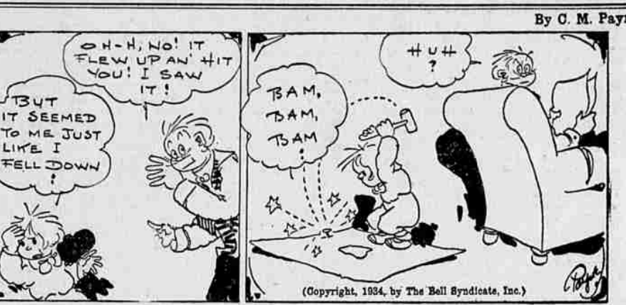
(Copyright, 1934, by The Bell Syndicate, Inc.)