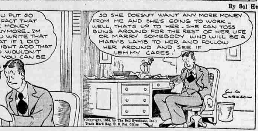
(Copyright, 1934, by The Bell Syndicate, Inc.)