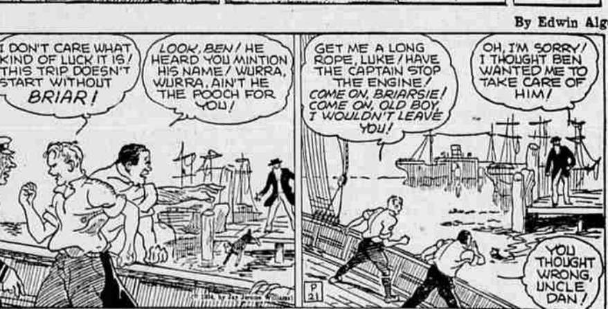
(Copyright, 1934, by The Bell Syndicate, Inc.)