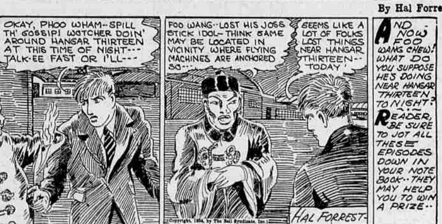
(Copyright, 1934, by The Bell Syndicate, Inc.)