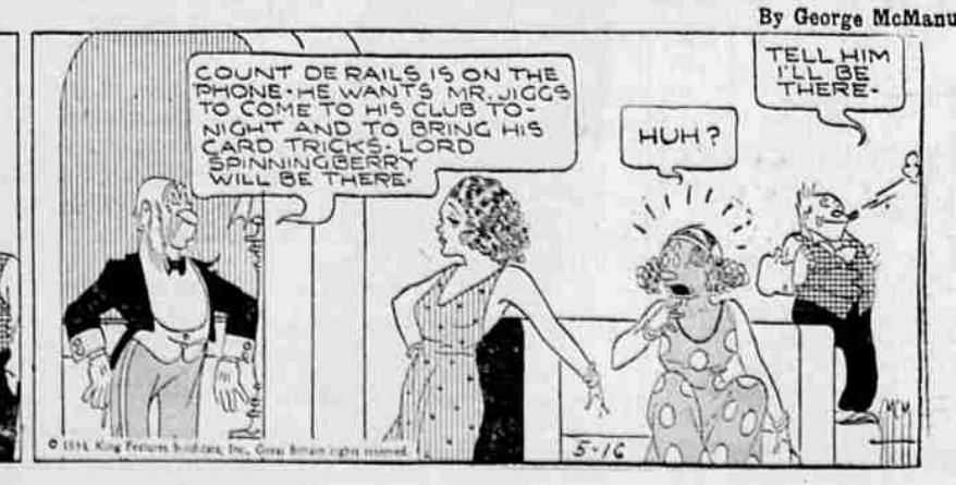
(Copyright, 1934, by The Bell Syndicate, Inc.)