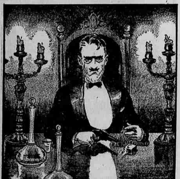
That strange corpse.

Harper frowned. "I wonder why he jumped to that conclusion so readily. At the moment I see no necessity for questioning Mrs. Dufresne about anything. I only hope that it turns out as he expects. I'm more than sorry he happened at all and I can't help feeling that I am partly to blame."