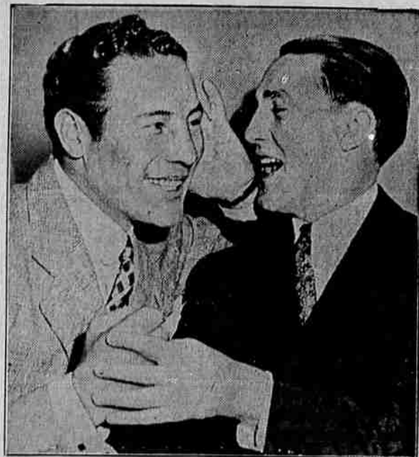
That's what Tommy Loughran (right) told Max Baer when the latter arrived in New York to establish training quarters for his approaching bout with Primo Carnera. Max seems to enjoy the account of Loughran's recent Miami battle with the champion.