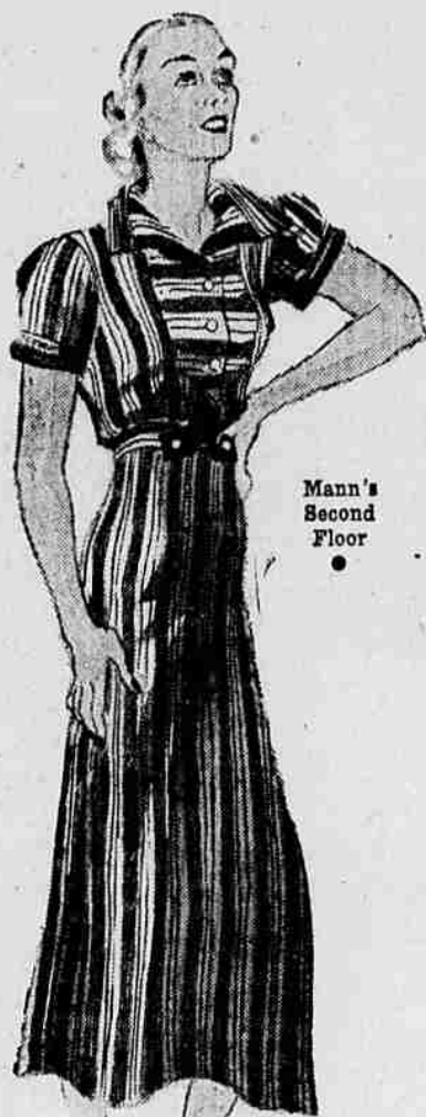
Mann's Second Floor