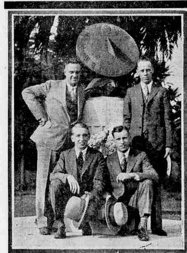
THE MORNING STAR MALE QUARTETTE