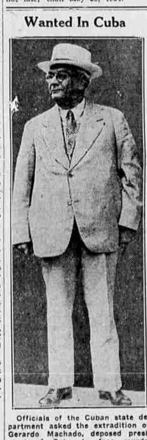
Officials of the Cuban state department asked the extradition of Gerardo Machado, deposed president of Cuba to face murder charges. He was widely sought in eastern states.