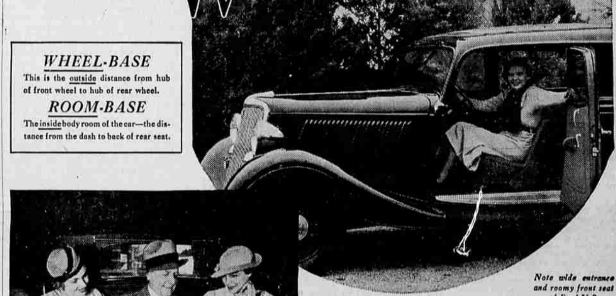
Note wide entrance and roomy front seat of Ford V-8

WHEEL-BASE This is the outside distance from hub of front wheel to hub of rear wheel. ROOM-BASE The inside body room of the car—the distance from the dash to back of rear seat.