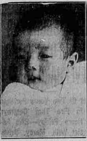
This is the first picture of little Prince Akhito Tsugu-No-Miya, taken the day he became three months old. He is the heir to the throne of Nippon.