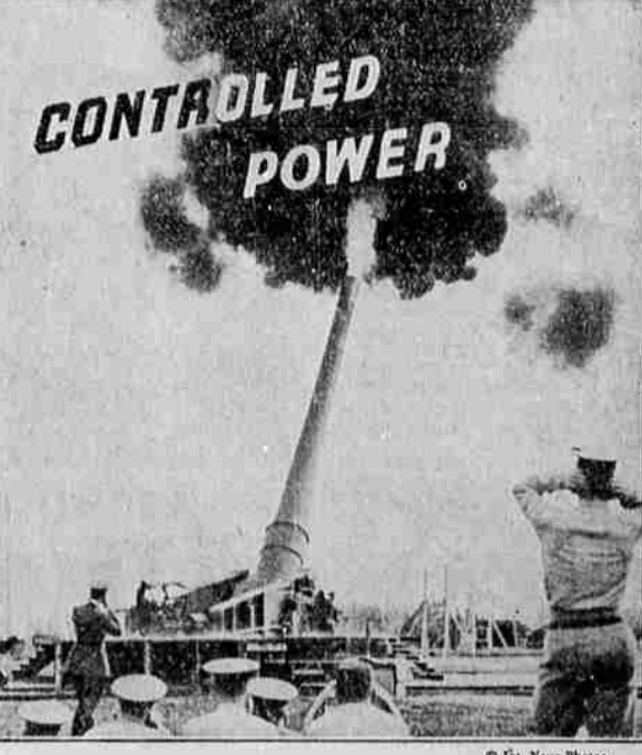
West Point Cadets studying the firing of one of the Army's 16-inch Bar-bette Guns at the Aberdeen, Md., proving grounds. The Controlled Power of the highly developed smokeless powder used in this long range gun makes its range effective at 30 miles. According to Gilmore, Oil Company engineers, this same Controlled Power, featuring an expansion of gases with tremendous energy exerted on the piston head for the full length of the stroke, makes super motor performance possible. (adv.)