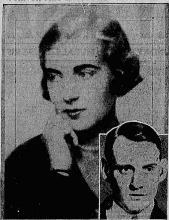
Despite official denials, it was learned from persons closely associated with Scandinavian royalty that the announcement of the engagement of the Danish Crown Prince Frederick to the beautiful Swedish Princess Ingrid is expected to follow upon the return of King Gustaf, Ingrid's grandfather, to Stockholm from the Riviera.