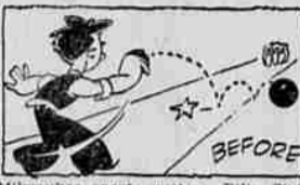
Four different alleys as a test of their instruction. The reward for the exhibitionists will be their free bowling during the training period and the chance that they may develop into first-rung players.

By CARROLL ARIMOND MILWAUKEE.—(AP)—Four human "guinea pigs" have completed more than half of their part in a unique sporting experiment that may introduce professional bowling instruction and raise it to the plane reached by golfing pros.