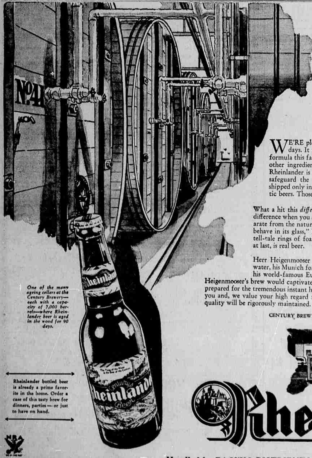
One of the many ageing cellars at the Century Brewery—each with a capacity of 7,000 barrels—where Rheinlander beer is aged in the wood for 90 days.