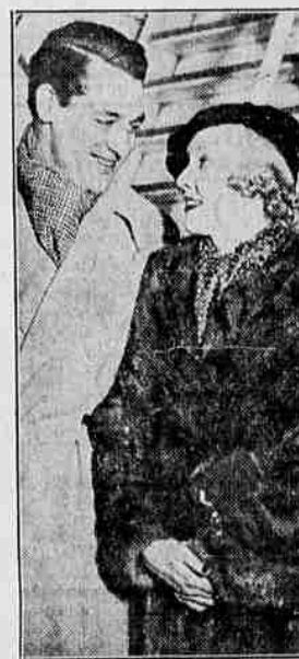
"And now we're going back to Hollywood and lead a simple life," said Cary Grant, film star, and his bride, the former Virginia Cherrill, also of the films, when they arrived in New York from London. They were wed two days before they sailed.