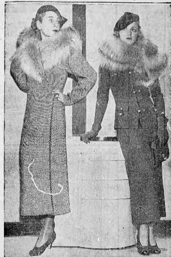
For early spring, the diagonal tweed coat at left is one of the latest models. Designed by Helen Cookman, it is black and white, with a large wolf collar. At right is a tailored wool suit of brown and mustard mixture, with a flattering fox collar, and brass buttons. The beret, gloves and purse are in matching brown. The outfit is worn by Claire Trevor of the films.