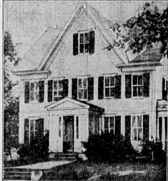
Nine Dartmouth college students died in the Theta Chi fraternity house (above) at Hanover, N. J., from carbon monoxide gas which swept through the 16-room house after a coal gas explosion apparently blew open the furnace doors and disconnected a chimney pipe.