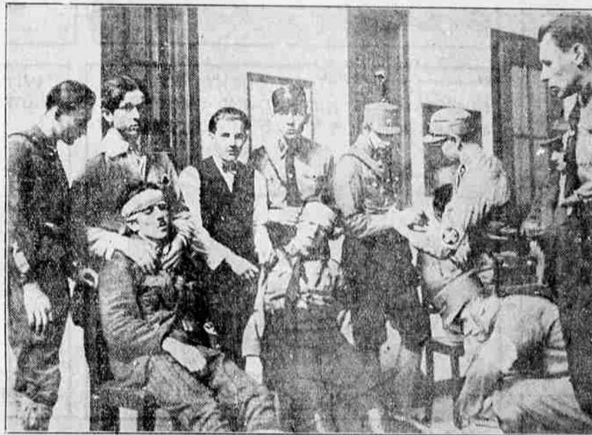
As Austrian socialists fought sullenly against government forces in an apparently lost cause, the toll of the civil war that has raged in many parts of the country continued to mount. Women joined their socialist husbands in the fighting. Above are shown fascists wounded in a previous political disorder. The socialists fear a fascist government.