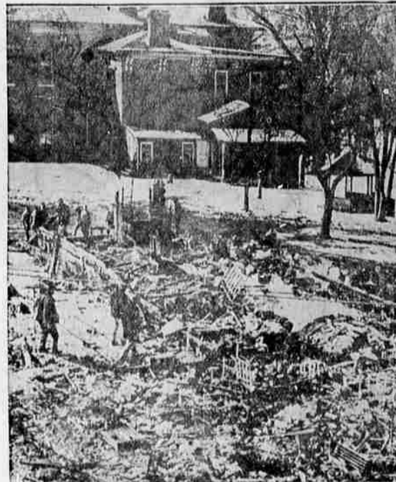
This picture of ashes and twisted bed frames tells the pitiful story of the death of 10 aged women in the infirmary of a memorial home at Brookville, Pa. They were trapped in their beds before firemen or nurses could rescue them.