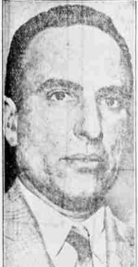
Cuba's new provisional president is Carlos Hevia, 33-year-old Ann Arbor naval academy graduate, named by a revolutionary junta after the resignation of Grau San Martin.