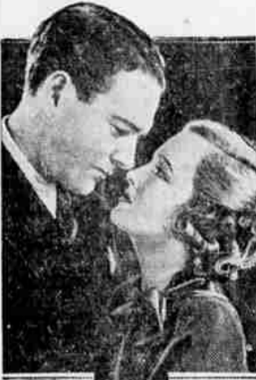
William Gargan and Marion Nixon are the two main leads in "The Lineup," coming to the Bialto tomorrow on their double feature program which will also have "S. O. S. Iceberg" on the same bill.

Gargan is featured as the young detective who combines business and romance when he helps Miss Nixon free herself from a suspicion of robbery. John Miljan is the "fence" for fur thieves and Noel Francis is his alluring assistant.