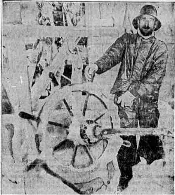
Landlubbers think it is bad enough to contend with ice coated streets and snowdrifts but what about the boys who go down to the sea in ships? This picture should answer that question.