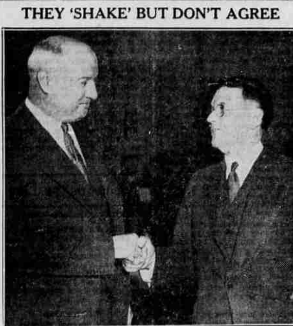
Postmaster General James A. Farley (left) and Walter Brown, who held the same job under President Herbert Hoover, are shown shaking hands when they met at the airmail contract hearing before a senate investigating committee, but they didn't agree on testimony. Brown said Farley told him that Hugo Black, committee chairman, was "just a publicity hound," but Farley said he didn't say it.