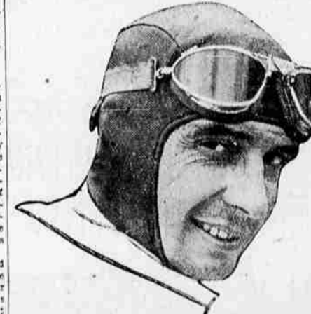
FRED FRAME—famous racing driver. Winner of Indianapolis Speedway Classic, 1932. Winner of Elgin Speed Car Race, 1933. Holder of twenty-one national and international world's straightaway records.

Here's what a Famous Racing Driver says about