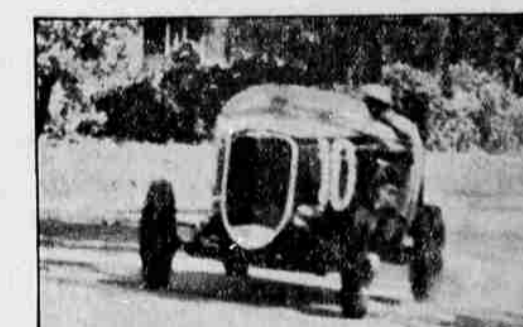
Fred Frame winning 1933 Elgin Road Race in Ford V-8

"I PICKED a Ford V-8 for the 1933 Stock Car Race at Elgin and I thought it was a great car when it brought me home in front. It takes a lot of automobile to average 80.22 miles an hour for 200 miles over a course like that. "When I heard that the 1934 Ford V-8 was even better than the 1933 job I was just a little doubtful. It just didn't seem possible, but I thought I'd find out. "I could see it was better-looking, but I wasn't much interested in that. The thing a racing driver looks at is the engine. How does it sound? How is it built? How fast will it go? How does it stack-up on gas and oil? "So I took it out on the road and opened it up. It held the road like a veteran and the way that speedometer touched the top numbers was something to