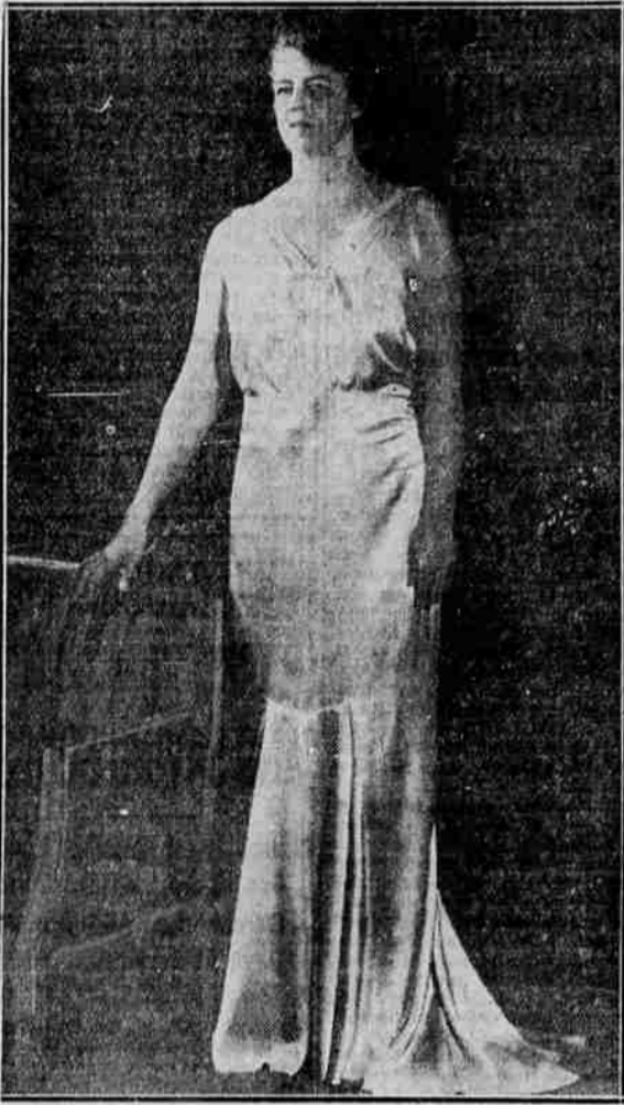
Mrs. Franklin D. Roosevelt poses in the striking gown which she will wear at the birthday ball for the President on January 30. It is of Georgia peach crepe satin trimmed with a brooch of jade and brilliants. Designed by Milgrim, New York, the gown was approved by Mrs. Roosevelt when she tried it on the first time.