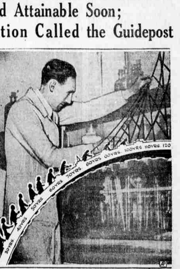
To keep people marching a longer time on the path of life is one of the tasks to which science has set itself...